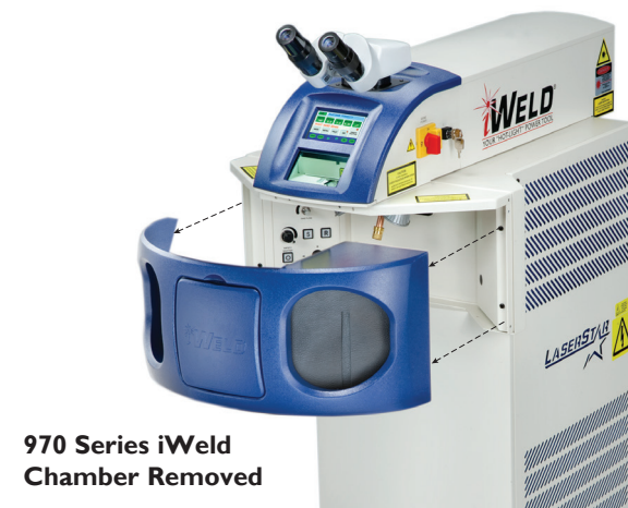
970 Series iWeld Chamber Removed