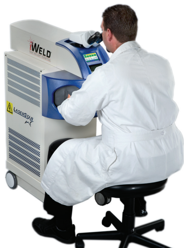
970 Series iWeld Professional

Technical specifications are provided on page 21